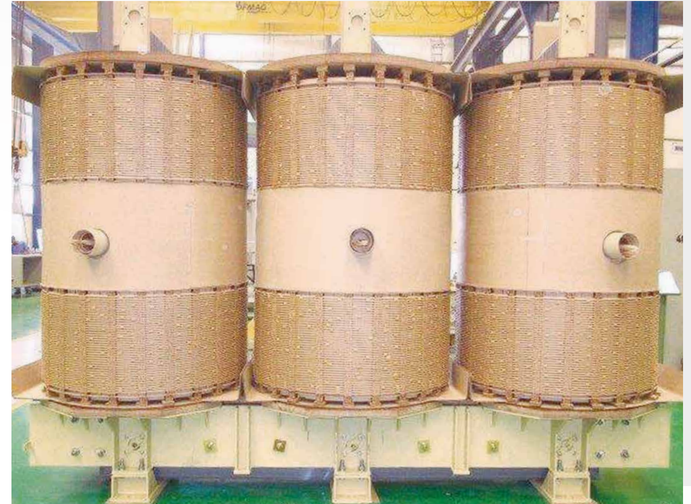
Active part of power transformer 230KV class