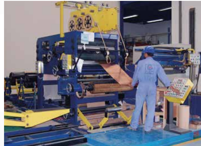
Foil winding machine