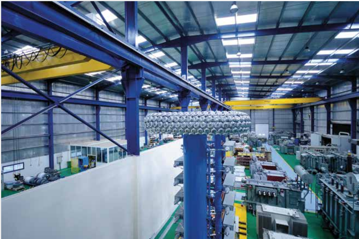
Inside view of the plant (test area)