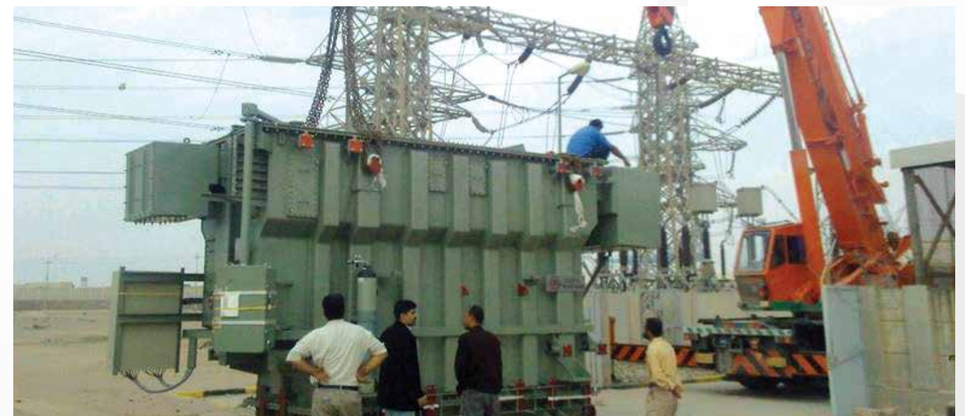
Transformer being erected at site (Iraq)