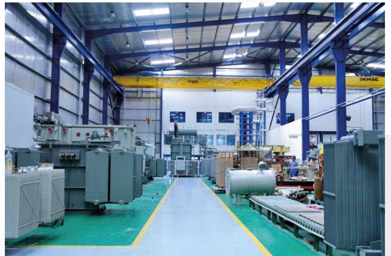
Inside view of the plant (assembly section)