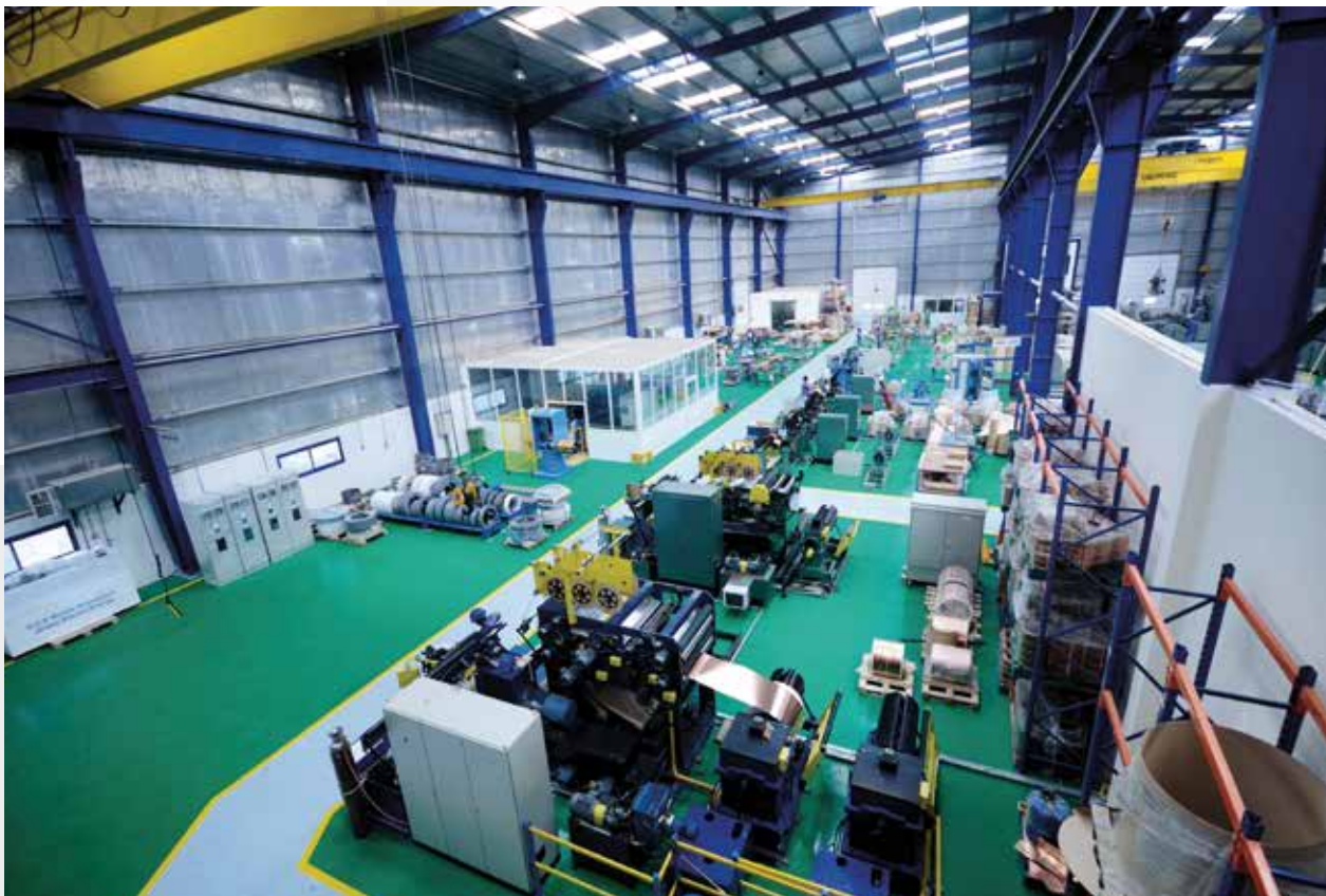
Inside view of the plant (winding section)