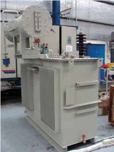
400kVA Earthing Transformer