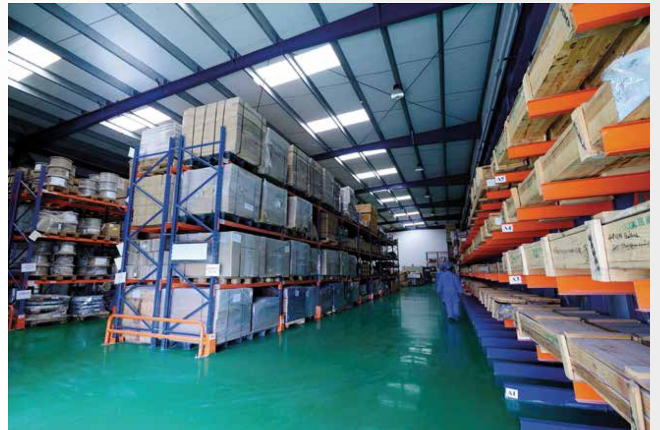
Inside view of the store