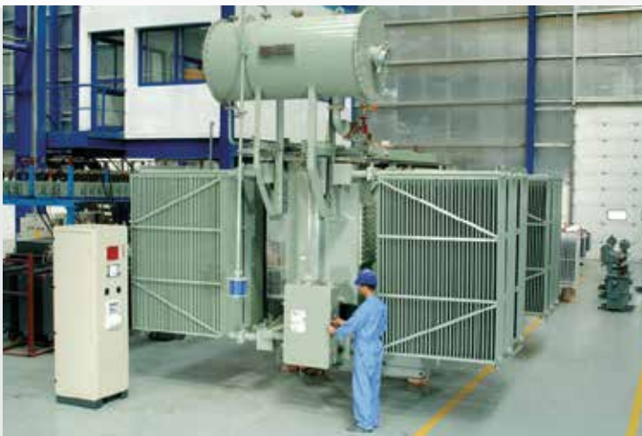
31.5 MVA, 33KV/11.5KV