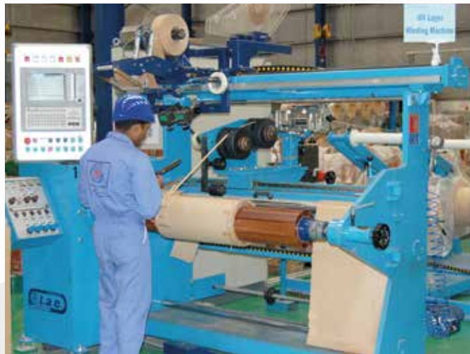
Distribution transformer layer winding