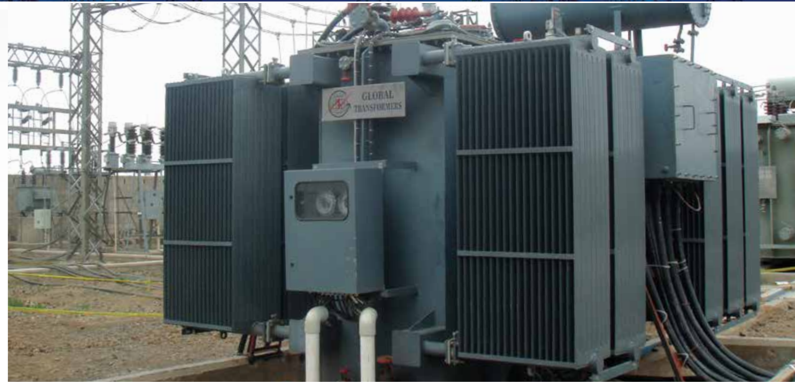
Commissioned at Site (Yemen)