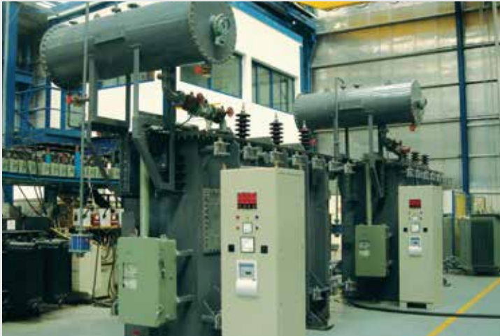
20 MVA, 33/11KV