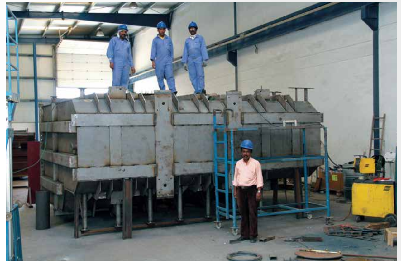
Power transformer tank