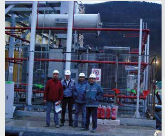
63MVA, 33KV/6.3-6KV Commissioned at Site (Turkey)