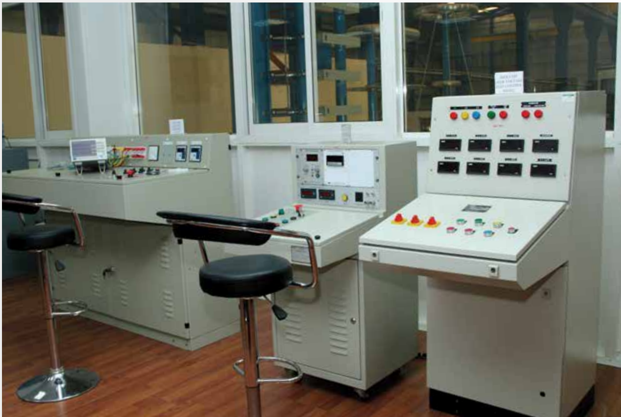
Test control desk