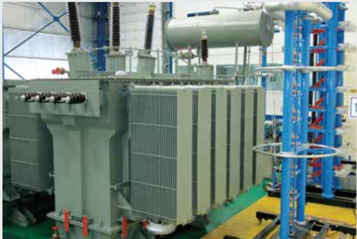
63 MVA, 132KV