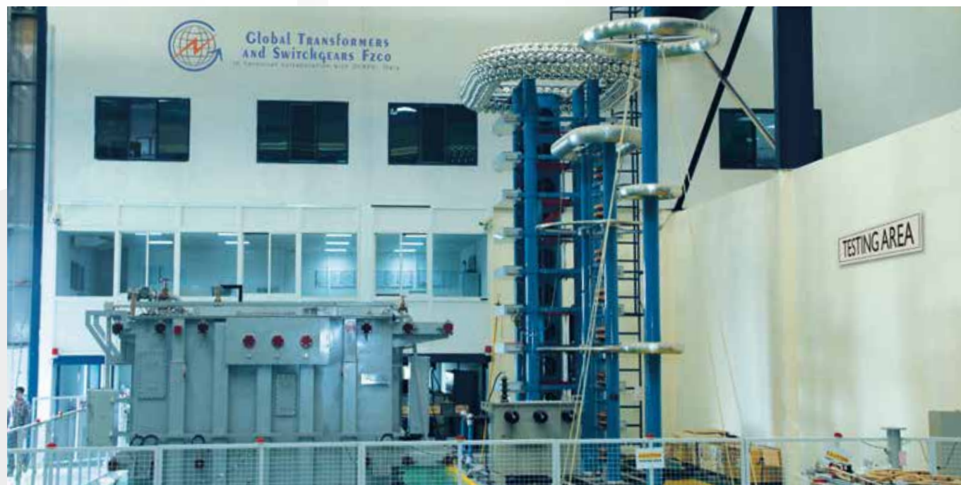
1800 KV/180kj Impulse testing system