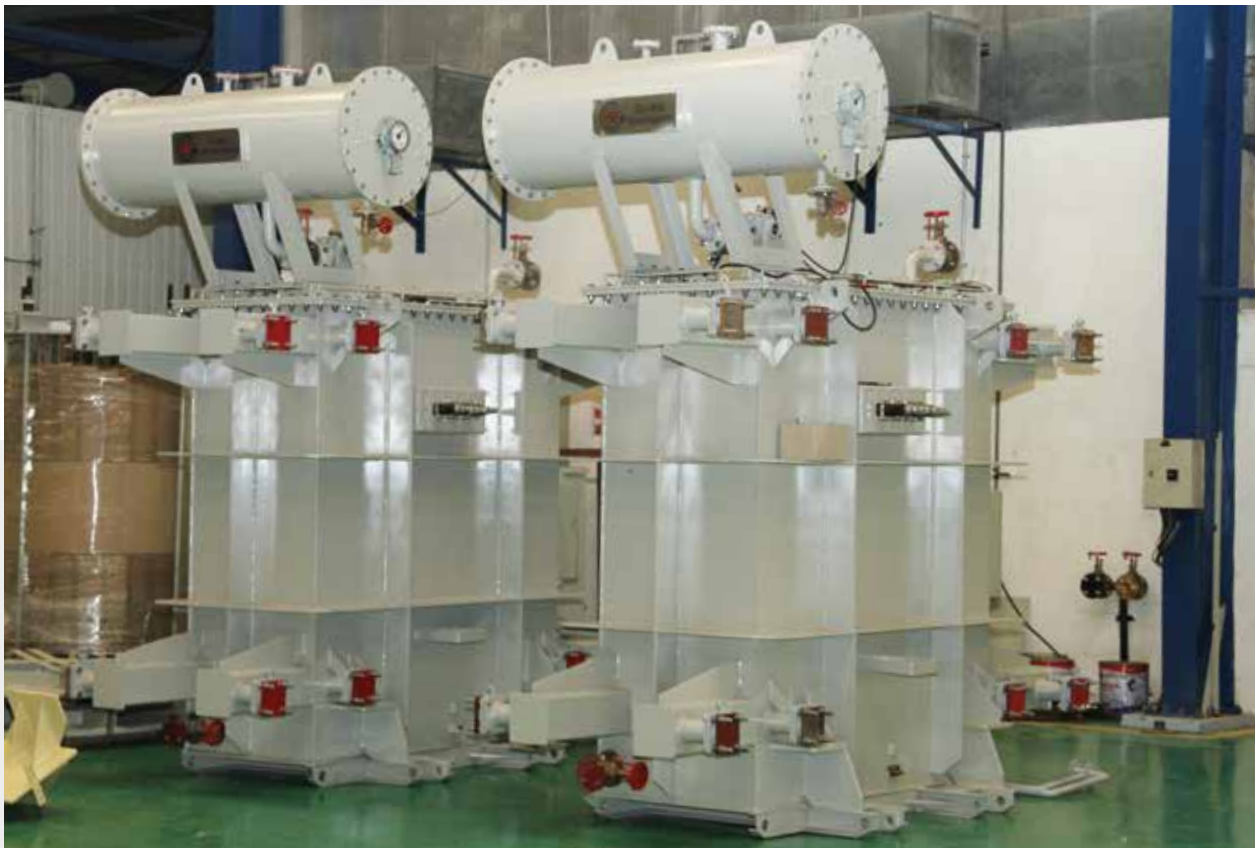
Medium power transformers