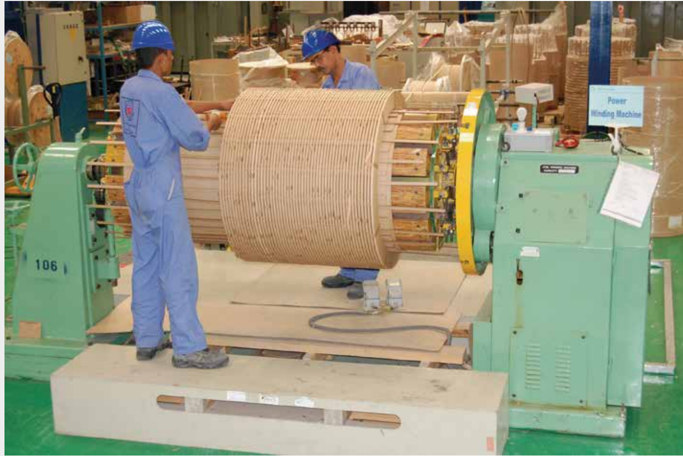
Power transformer winding