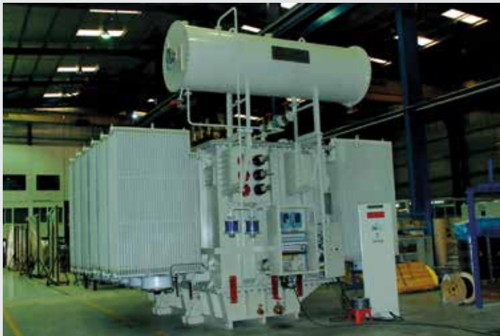
63 MVA, 33KV/6.3-6KV